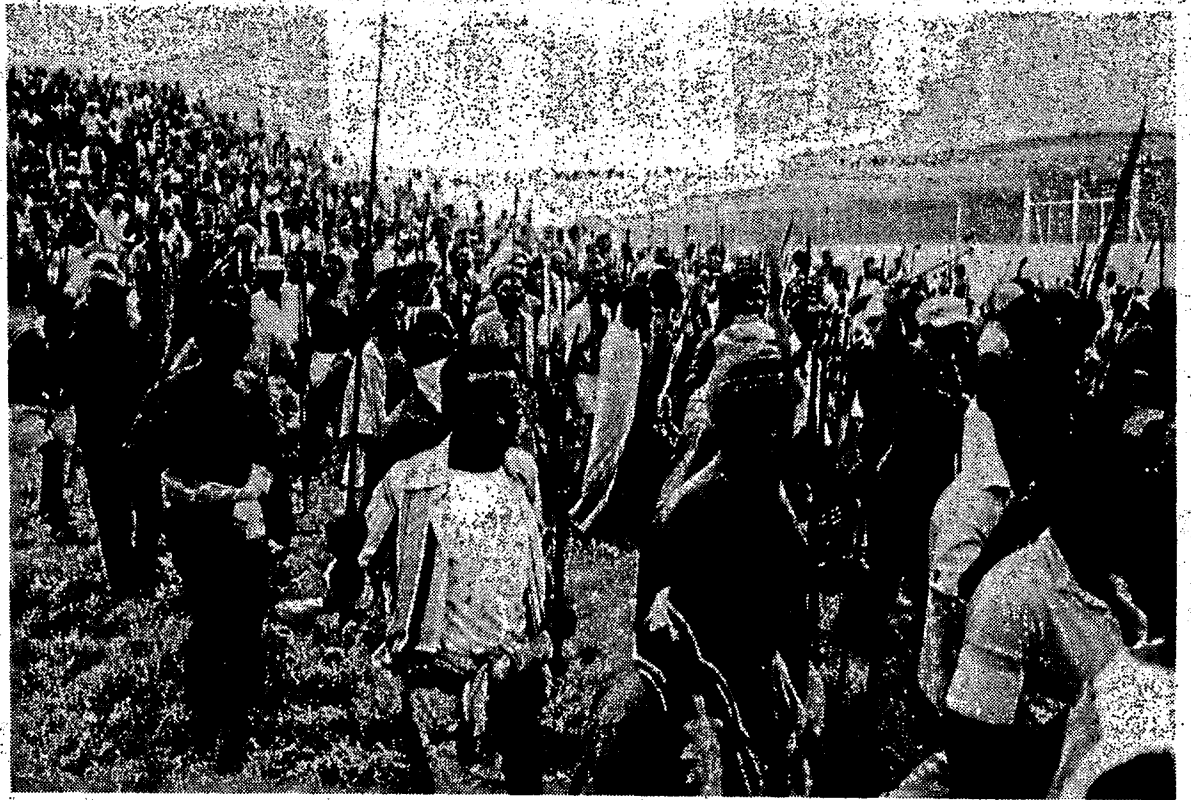
An Inkatha impi occupies the King Zwelithini stadium in Umlazi to prevent an ANC rally

Inkatha even sent its impis to prevent the ANC from holding a rally at the King Zwelithini stadium in