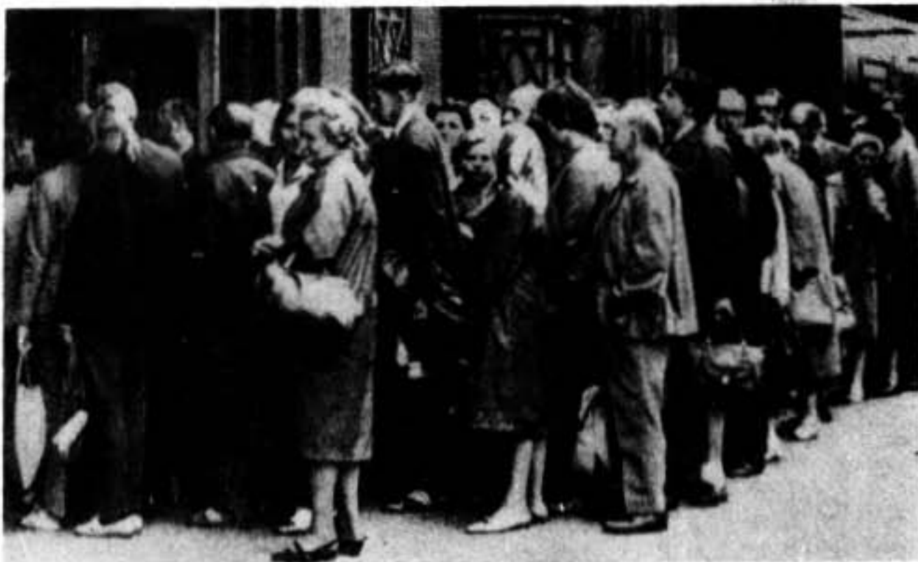
Shop queues, such as this one in Warsaw, are a common sight in Poland. Bureaucratic mismanagement means shortages of consumer goods.

With the defeat in 1945 of the German forces occupying Poland, the Soviet Red Army was left in effective control. The capitalist state had crumbled. The Polish ruling class, fearing punishment for their collaboration with the