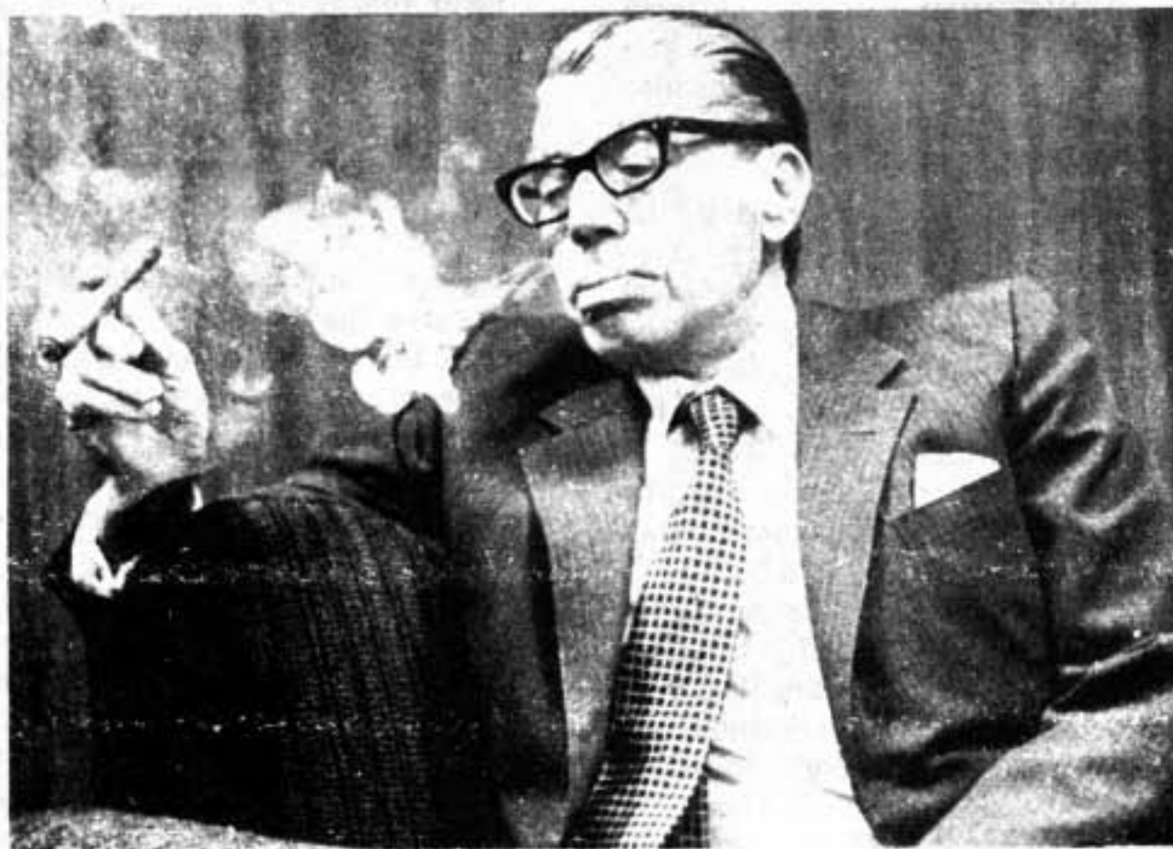
The richest 10% in South Africa receive 58% of the national income.

imprisonment, banishment, torture and murder of workers' leaders and the harassment and victimisation of trade unionists in general. Yet, reflecting its own weakness, the ruling class cannot contain this movement by repression alone. It is forced to supplement its tactics with new means of control and division—attempts to take back by manoeuvres the gains that have been won.