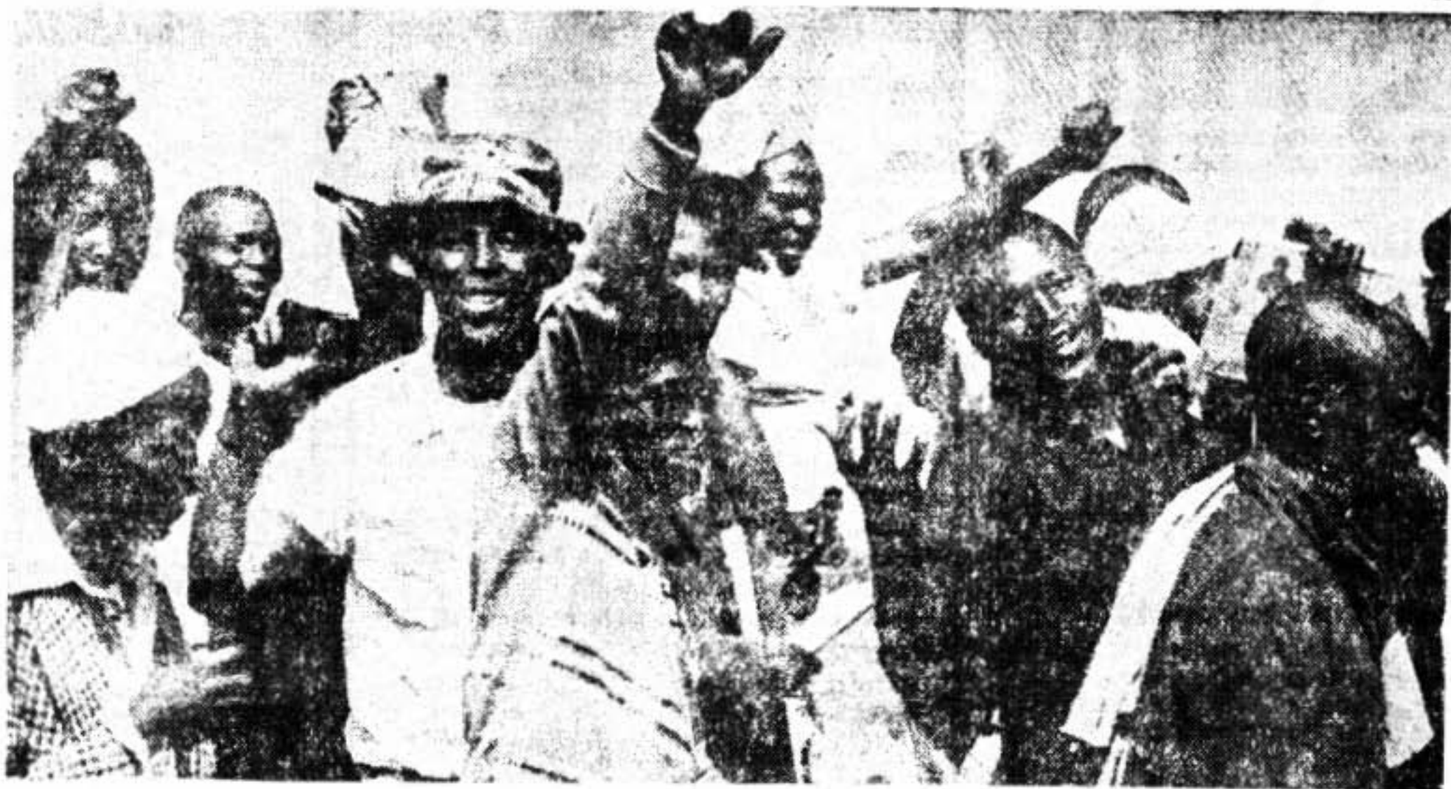
"The strike movement itself spills over into bus boycotts..."

extent to which disunity between migrant and non-migrant workers can be healed in the forward march of the struggle.