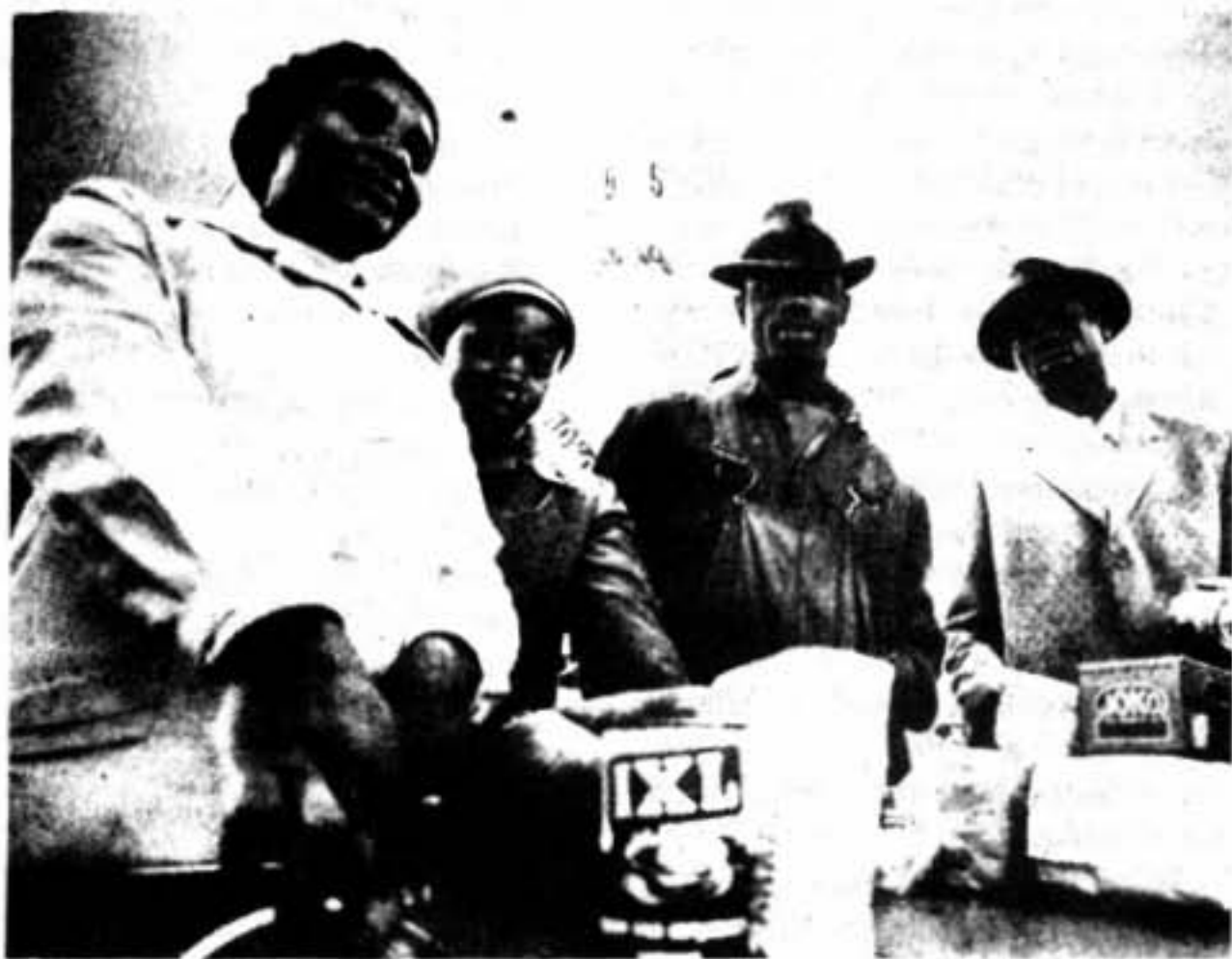
To stop rising prices, capitalism must be overthrown.

The mass movement of the 1970's has embraced widely diverse sections of the oppressed, all engaged