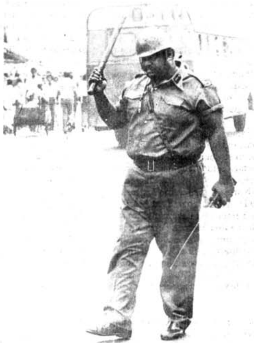
SCENES FROM THE GENERAL STRIKE: (right) Police thug threatens workers; (below) Mass meeting of the GCSU.