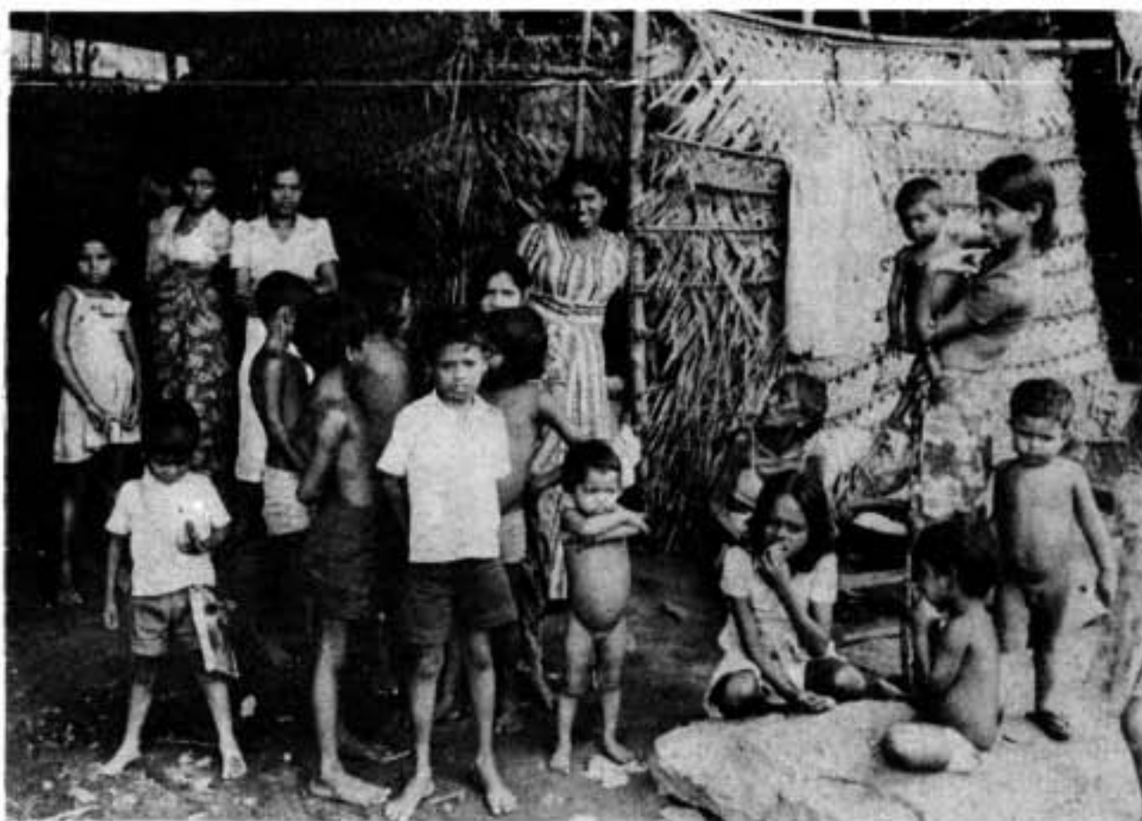
Average wages in Sri Lanka are 500 Rupees a month—yet a family with 3 children needs 1500 Rupees just to survive.

After the formation of the NSSP in December 1977 we began to campaign for the Joint Trade Union Action Committee (JTUAC) to unite all trade unions in the fight against cuts, redundancies, repressive laws and so on. We knew when fighting for the JTUAC that it