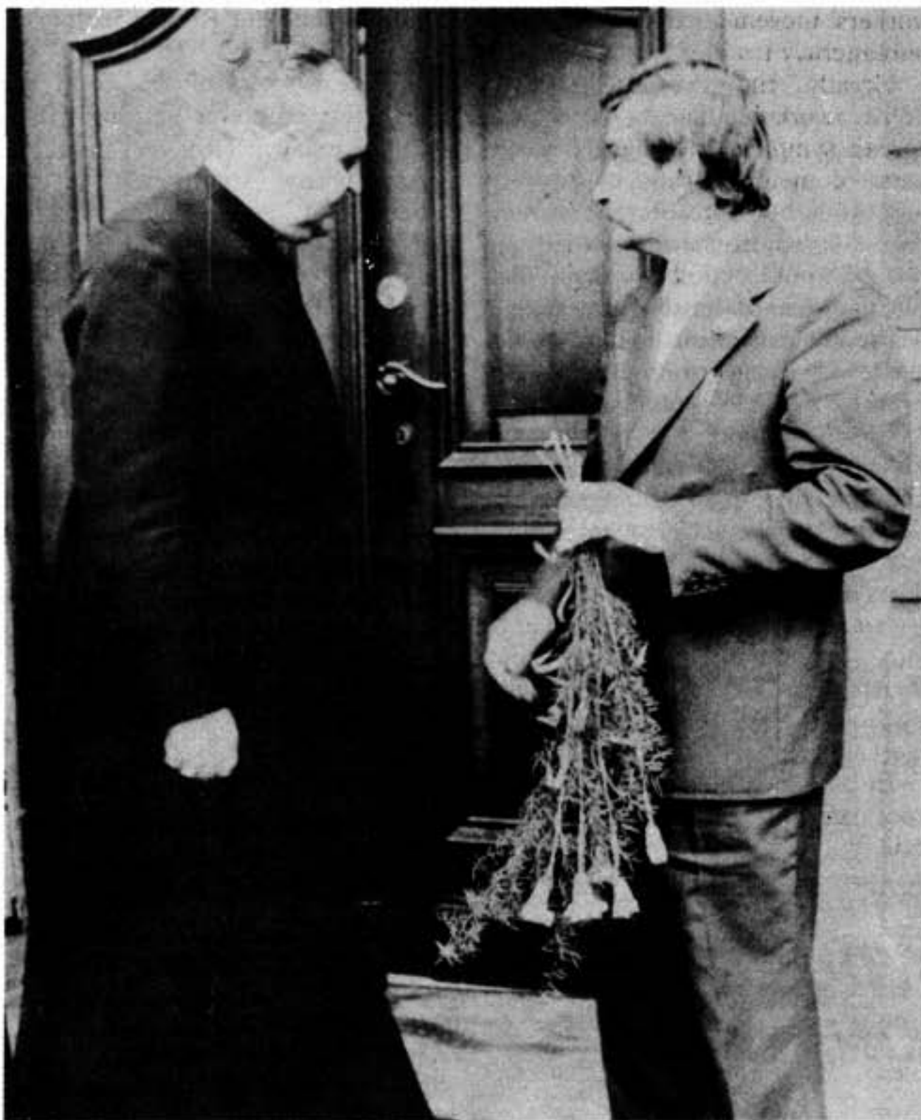
Lech Walesa, leader of Solidarity, waiting to meet with Cardinal Wyszyński, head of the Polish Catholic Church.

movement. Nothing but their own independent struggle has won them their present gains and kept the Soviet bureaucracy at bay.