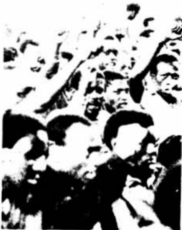
Car workers are showing their growing determination in struggle.

More and more, in the experience of mass struggle, the oppressed are discovering that there is not a single concrete need that can be fully satisfied without sweeping away, not simply the