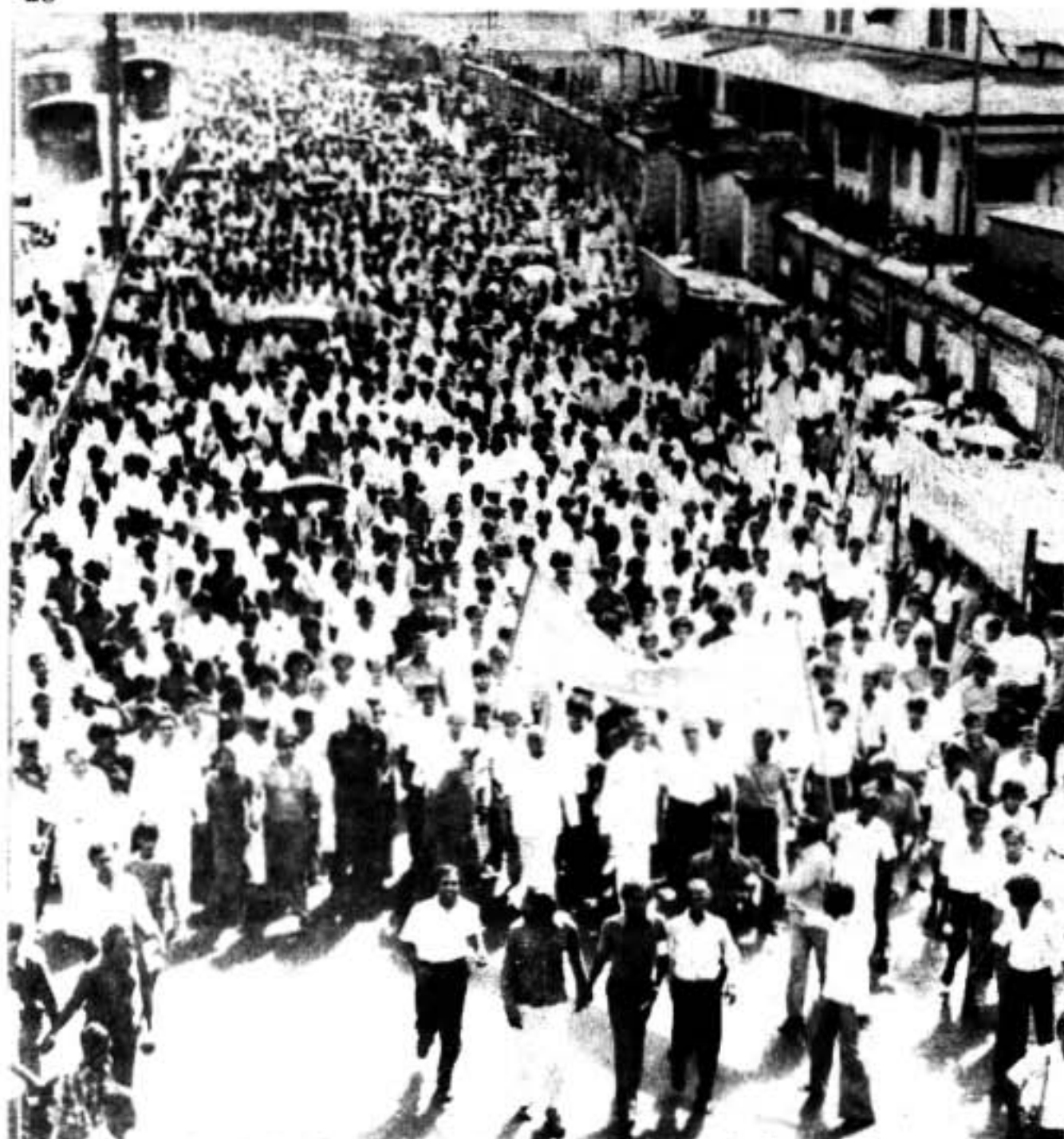
NSSP leaders head the funeral march through Colombo in June 1980.

loyment, wages, land, water etc, and put a programme for a left front to take the country forward. This is an open programme, to be discussed by all the parties.