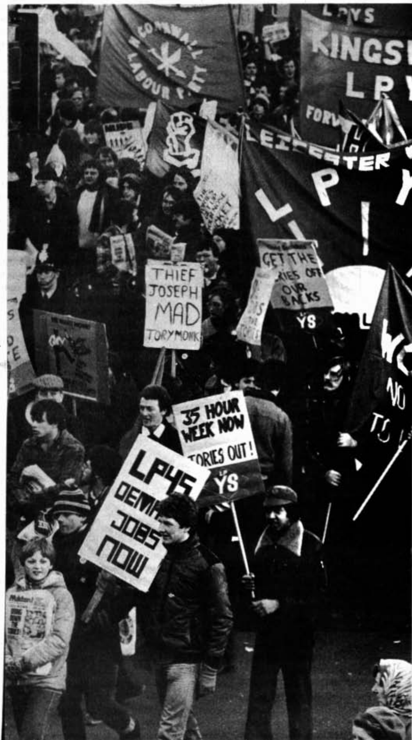
150 000 trade unionists and Labour supporters demonstrate in Liverpool against massive unemployment created by the Tory government.