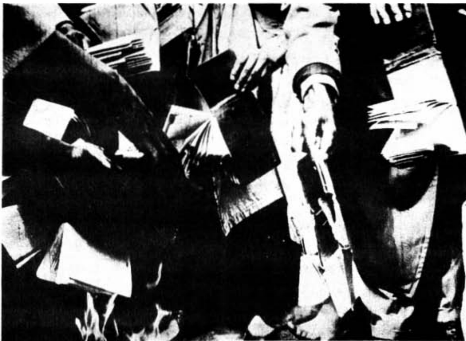
Pass-burning in the 1950s. Can South African capitalism survive without the pass laws?

The comrade in the African Communist appears to believe that Comrade Petersen's memorandum accords the leading role in the revolution to the trade union movement, and reduces the struggle to the struggle at the point of production. But this is not the position of the memorandum and indeed it would be a ludicrous position for any Marxist to argue. The memorandum deals, on the one hand, with the general nature and tasks of the revolution in South Africa and the corresponding tasks of the workers' movement. On the