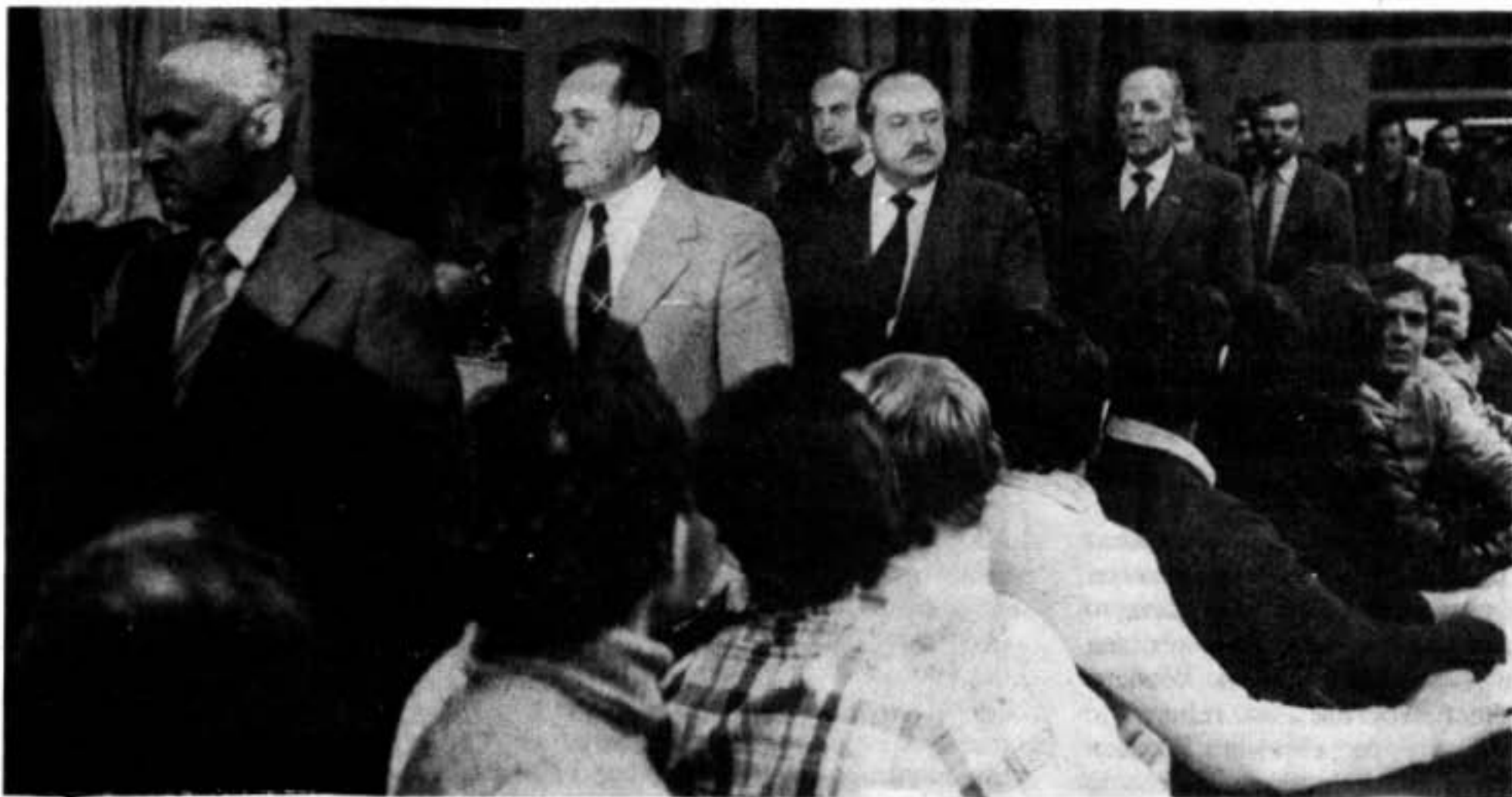
Gdansk, September 1980: grim-faced state officials arrive to negotiate with the delegates from 400 factories on strike.

The basis for the crisis in food production, which sparked off the present struggles, was laid in 1956. In that year the bureaucracy was threatened by a major movement of the Polish working class. In order to gain support in the countryside,