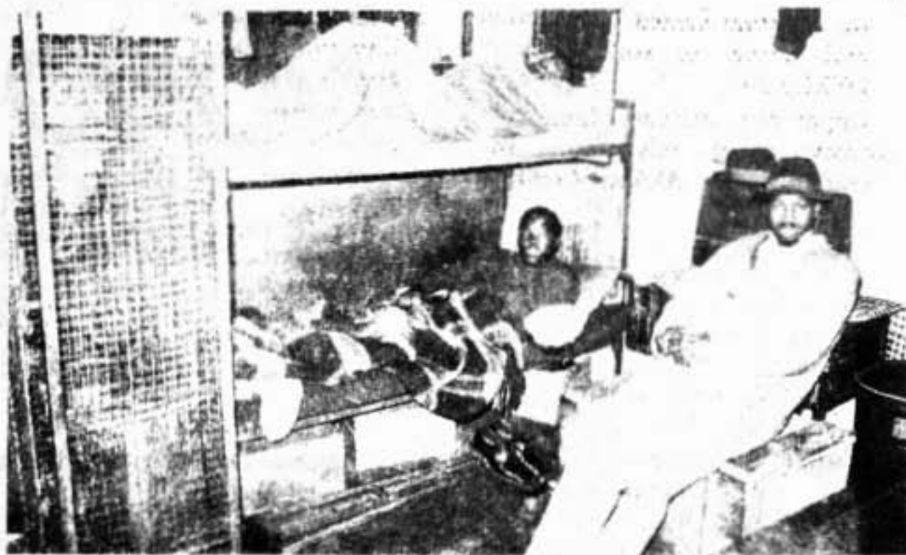
The organisation of the migrant workers into the trade unions will have revolutionary significance.

It is the comrade in the African Communist, in reality, who wishes to limit the tasks of the working class. For him, the tasks of the working class are confined to the "immediate struggles at the point of production". For him there are