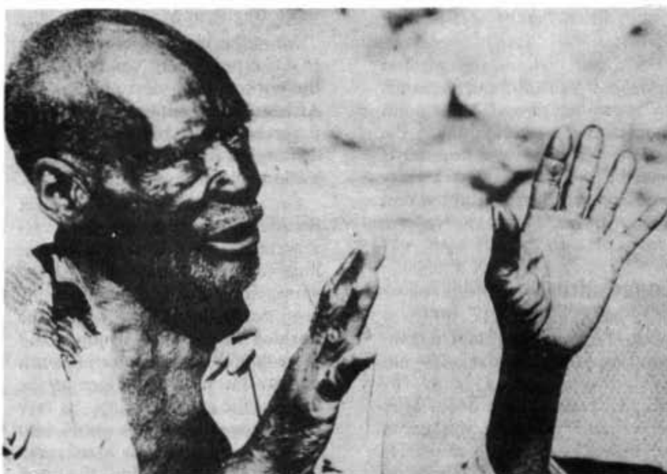
Capitalism cannot concede pensions or basic social welfare to the majority of the working class in South Africa.

Just the fight for the means of survival itself represents, therefore, a challenge to the right of the capitalists to exact unlimited profits. But it is more than this. For, in building the trade unions, the working class—"defying" and "treating with the employers as a power"—constitutes itself as a collective force, and strengthens its